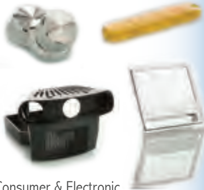
Consumer & Electronic